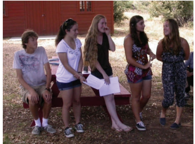
Student Council board members at the Labor Day retreat

For students wanting to be involved in CYO in more ways than just playing an instrument, seek out the